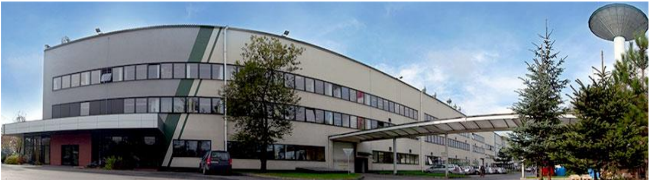
Fig. 1. FAKRO PP Sp. z o.o. manufacturing plant located in Nowy Sącz, Poland.

FAKRO is a private company established in Poland in 1991. The company is manufacturer of wooden and aluminium-clad plastic roof windows of different designs and opening methods, flat roof windows, flashings, automatic control, access roof lights, light tunnels, smoke ventilation, vertical windows, loft ladders, accessories for roof windows: venetian blinds, pleated blinds, internal and external roller shutters, external awning blinds, installation accessories and roofing membranes and underlays. The company employs approximately 4 000 employees. The company has 11 manufacturing companies and 17 distribution companies all over the world. FAKRO has an extended distribution network in over 60 countries where there is a demand for this type of product. Export sales account for 70% of total sales.