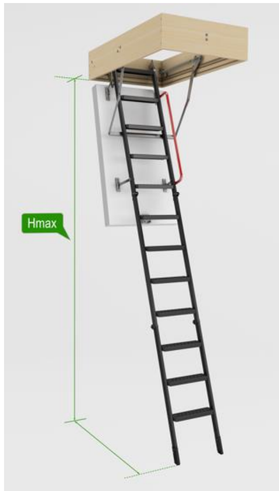
Figure 1. Maximum room height